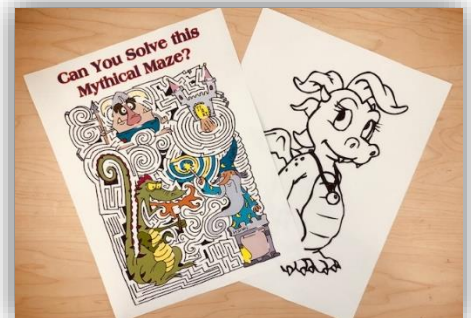
Journey through a Maze

Follow this link for more information about the Summer Reading Program and the prizes you could win.