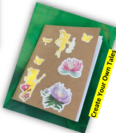
Create Your Own Tales