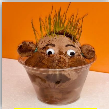
"Grow" Your Own Troll