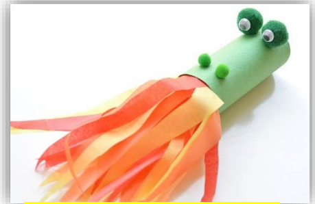
Yikes! A Fire-Breathing Dragon